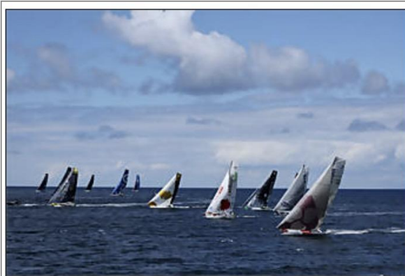
La partenza - Photo credit: © Alexis Courcoux

La Transat CIC ha preso il via domenica alle 13,30. I 48 skipper sono partiti da Lorient verso il traguardo di New York in una bella giornata primaverile, con un vento di circa 15 nodi.